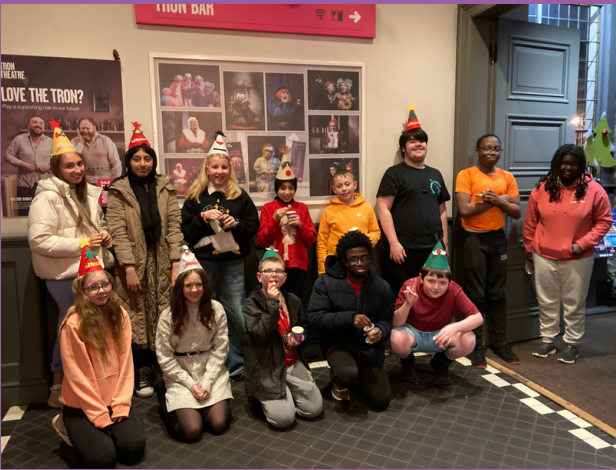
Glasgow North East Carers Centre