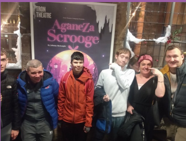
Blue Triangle Housing Association

Give away tickets not only to panto, but other Tron shows across the year